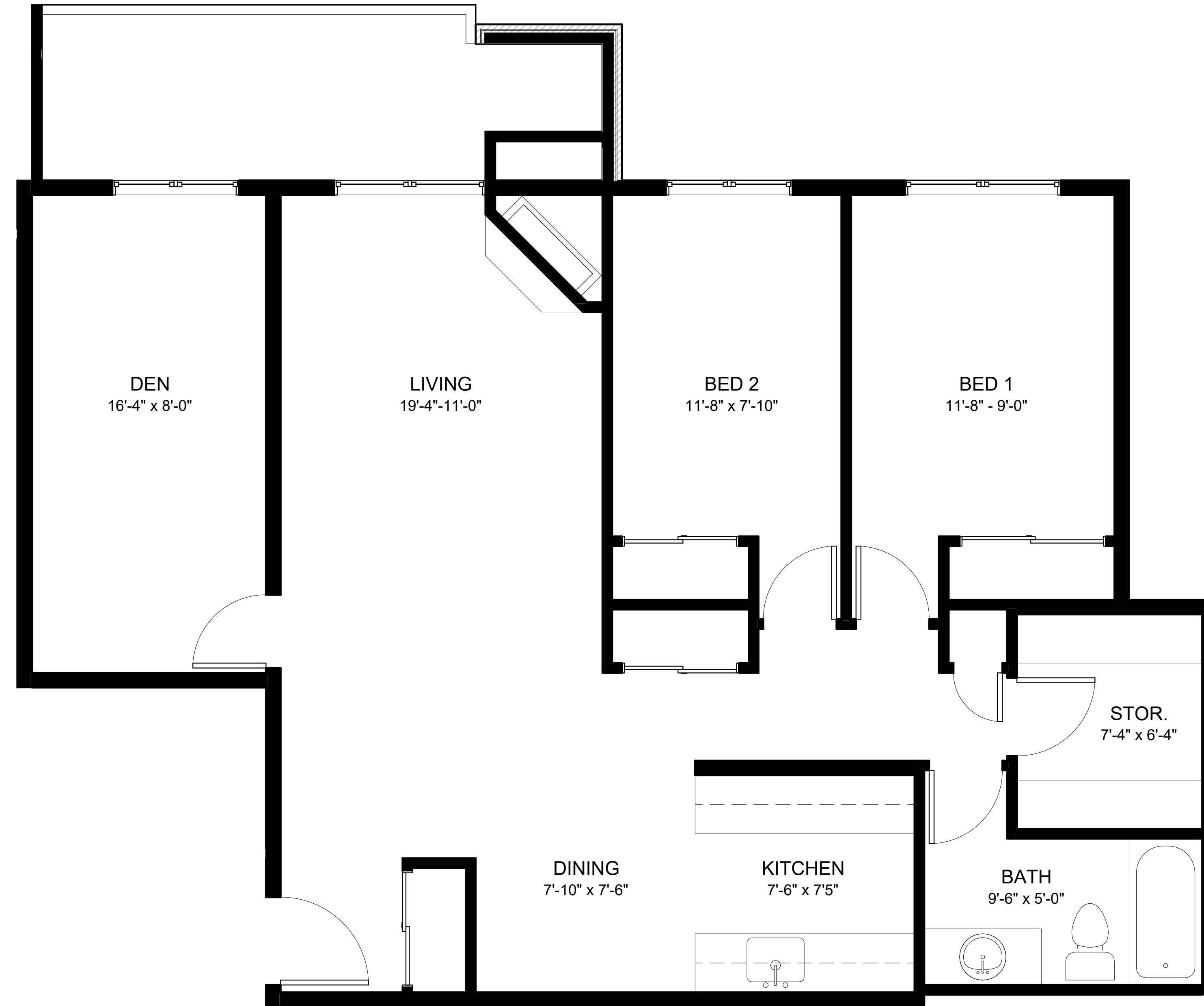
3 TYPE B - TWO BEDROOM UNIT + DEN A1.6 3/8" = 1'-0"